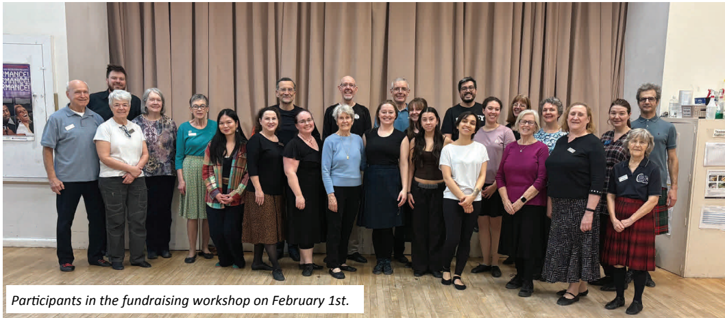
Participants in the fundraising workshop on February 1st.