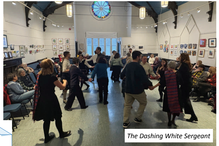
The Dashing White Sergeant

Please contact Moira Korus , Education and Training Convenor, if you are interested in obtaining advertising materials for SCD: flyers, posters, and business cards with QR codes.